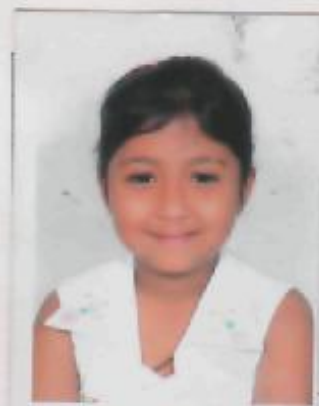
TAMANNA VII E