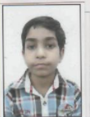
PRATHAM VII G