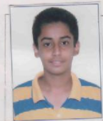
Gaurshaam IX - E