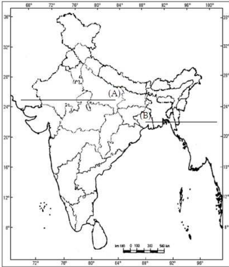
Political Map of India